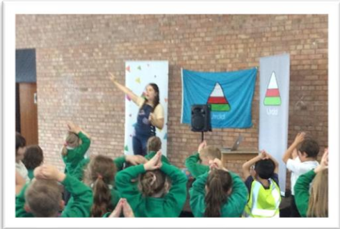
Years 1 to 4 from both streams joined the Jambori at The Royal Welsh Showground where they joined in with Welsh songs, rhymes and dancing.