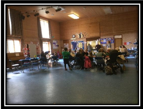
Congratulations pupils of Dosbarth Eryri for organizing such a lovely Macmillan Coffee Afternoon. Thank you to everyone who donated cakes. They were delicious!