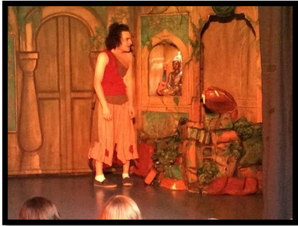
M&M Theatre Production – The Jungle Book enjoyed by the whole school.