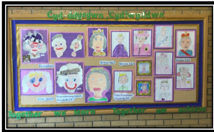
Remembering Her Majesty Queen Elizabeth II.